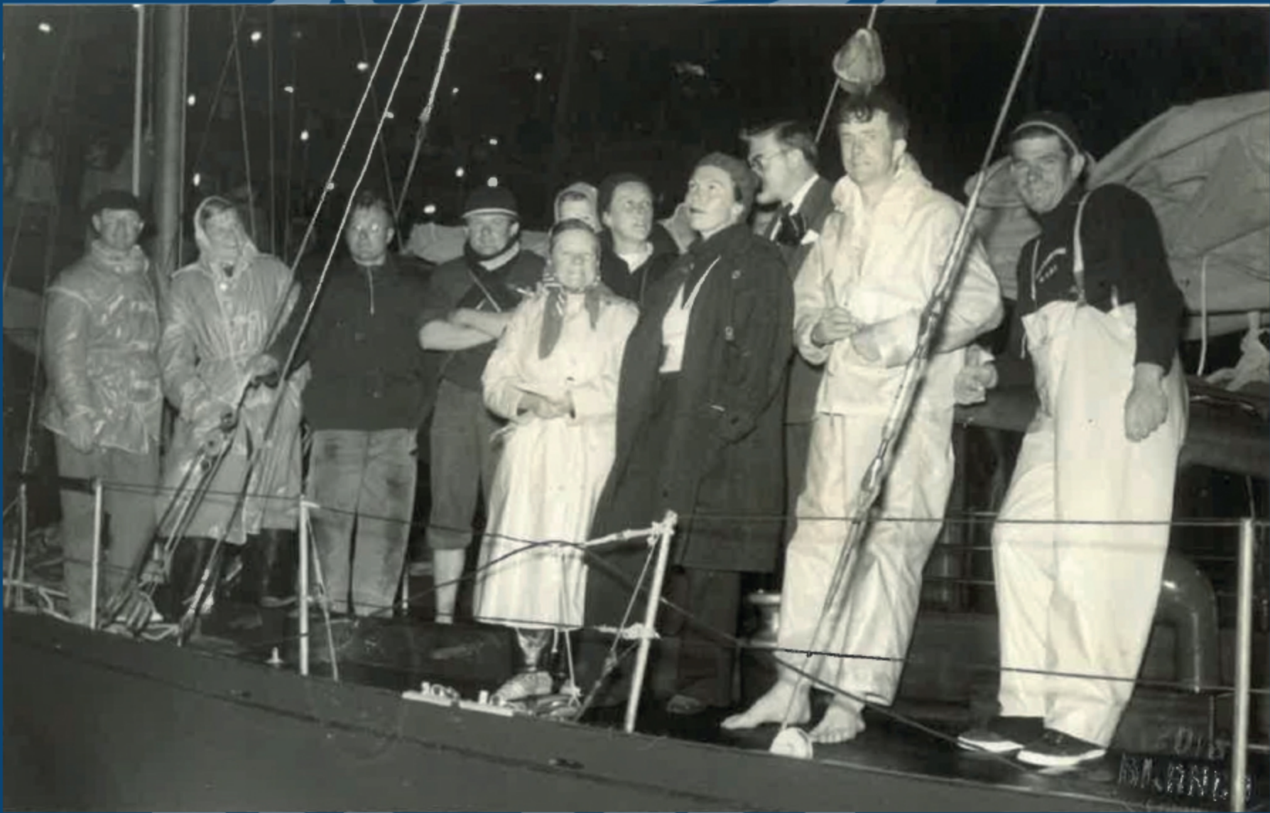
1954 Cowes La Coruna Bloodhound Crew