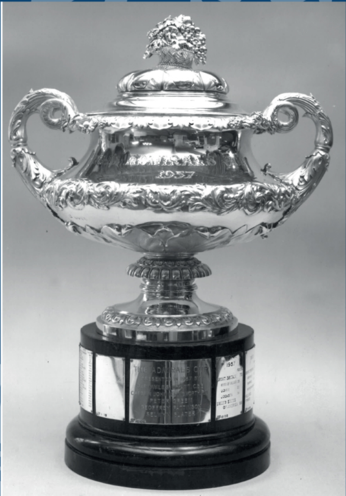
The Admiral's Cup: Inception of the renowned international team competition